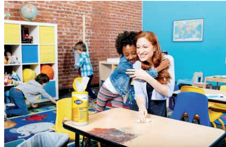
CloroxPro HealthyClean™ Educational Platform — Helping Cleaning Professionals do their Job Effectively, Efficiently and Safely

Today, understanding the responsibility we place on cleaning professionals is only part of the solution. Ensuring that they not only have the tools to keep public spaces clean and healthy but also support, training and educational resources is key. For more than a century, Clorox has offered consis-