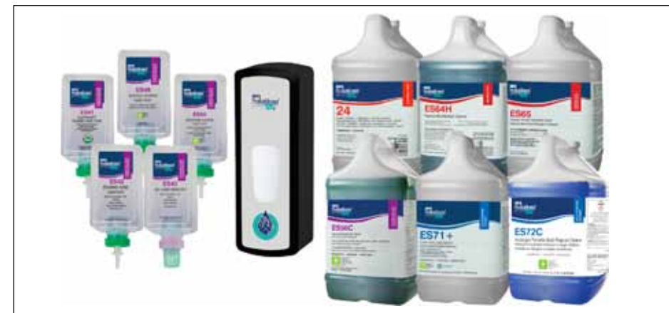
Enviro-Solutions® Products Help Reduce the Spread of HAIs

In the world of healthcare, infection control is paramount. Healthcare-Associated Infections (HAIs) pose a significant threat to patient safety and can lead to severe complications, increased healthcare costs, and even fatalities. The cleaning industry plays a crucial role in preventing the transmission of HAIs, and Enviro-Solutions® has the products to help. In this blog post, we'll explore the critical issue of HAIs and how Enviro-Solutions® products are contributing to the fight against them.