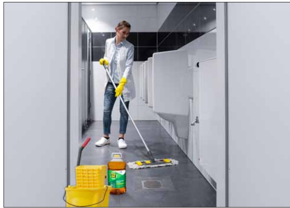
Efficient Solutions, Proven Results

As the No. 1 choice for disinfecting wipes 4 , Clorox continues to champion public health and provide effective and efficient solutions to its customers. Further, with versatile solutions